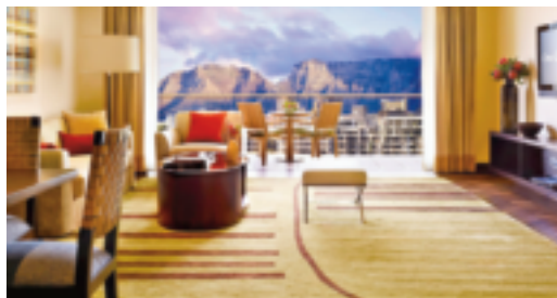
Clockwise from top: The Victoria and Alfred Waterfront, Africa Nova, Delaire, The Old Biscuit Mill, and One&Only Cape Town.

STAY The One&Only Cape Town embodies all the glamour you've come to expect of the jet-set resorts: a tony Victoria and Alfred Waterfront address, sleek Adam Tihany-designed interiors, and a spa on its own island - not to mention Table Mountain views from all 131 rooms (doubles from $881, including breakfast and a 50-minute spa treatment). The recently renovated Cape Grace features 121 charming waterfront rooms with handpainted fabrics and artisan glass- and metalwork (doubles from $736, including breakfast, a bottle of wine, and a 30-minute massage). The Ellerman House also promotes all things South Africa - albeit in a more intimate setting overlooking Bantry Bay. Staying at the stylish 13-room mansion is like staying with a well-heeled relative: Guests have full run of the house, whether they want to raid the larder at midnight or stroll through the gardens (doubles from $521, including breakfast and a bottle of Champagne).